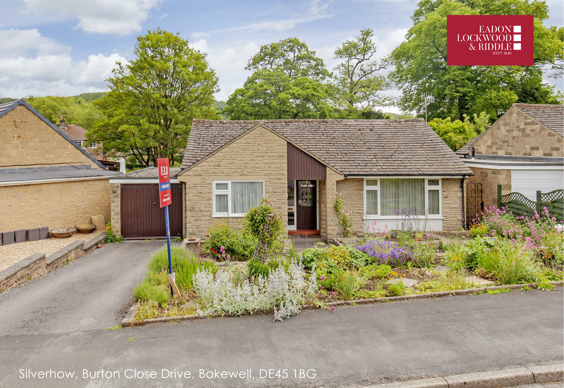
Silverhow, Burton Close Drive, Bakewell, DE45 1BG